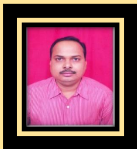
CHAIRMAN & CO-COORDINATOR